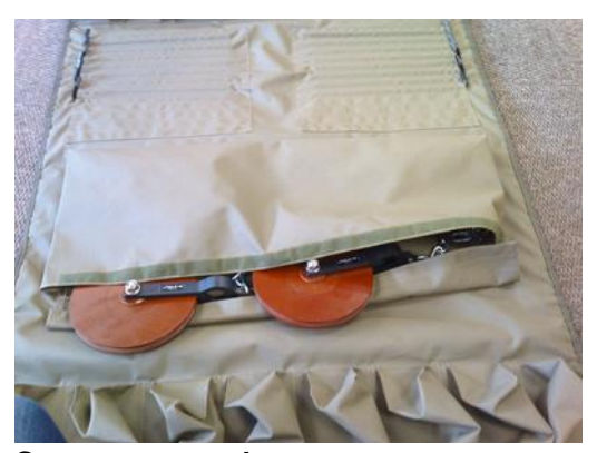
Storage canvas bag